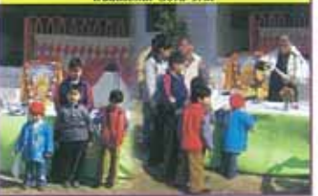
Reciting Sharda Vandana & receiving a copy of traditional Gora-Trai