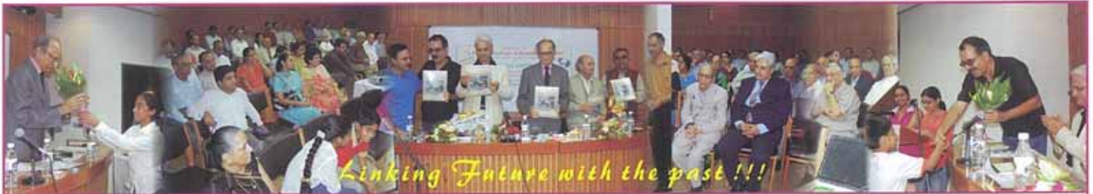
Linking Future with the past !!!

A photo-album titled "A Photo-Portrait of Kashmiri Pandits" was released by former Governor of the J&K State, Mr Jagmohan at India International Centre, here in New Delhi on Saturday the 10th of Nov. 2007, at an impressive function, organised by "Nityanand Shastri Kashmir Research Institute (NSKRI)" and "PAANNYAAR" the two institutions of Kashmiri Pandits working for the preservation and promotion of over 5000 year old rich cultural legacy of the community.