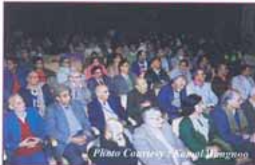
Glimpse of the audience