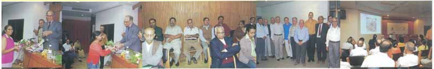
Photo feature / Report .. release of "A Photo Portrait of Kashmiri Pandits"