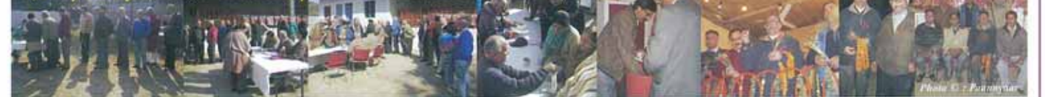
Displaying proudly the copy of Gora-Trai