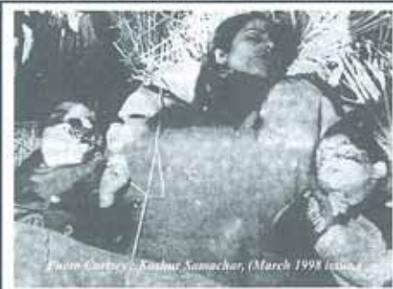
A glimpse of Wondhama massacre in which 23 minority Kashmiri Pandits became victims of Islamic terrorism way back in Jan. 1998.

Terrorism has also had a flip side to it. Since the start of militancy in 1989, state has got the lion's share of Central resources. In 2001-2002 it got 10% of the total assistance given to all states. Since 1995, it has got more than any other state. To quote an interesting statistic, a Kashmiri gets eight times more money from the Centre than any other Indian. If the money given were to be distributed to each family (of 5 persons) they would get Rs 40, 460 / year. Per capita consumption has shot up from Rs 134/ month in Eighties to Rs 746/ month in 2000. It might be of interest to note that J&K has the lowest poverty level in India. In 1980 percentage of people BPL was 24.24%, which dropped to 3.48 % in 2000. Compare this with 26.10 % in India, though the State's contribution was less than 1% of the GDP in 2000-2001. Even within the State